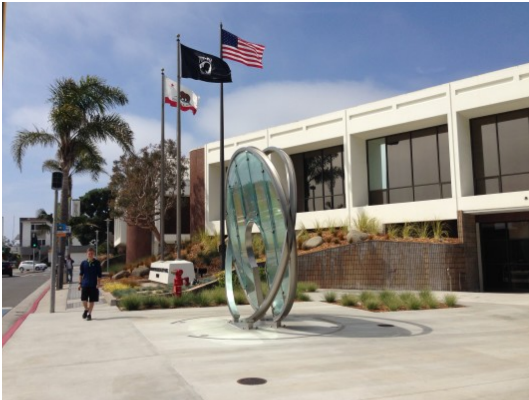
Manhattan Beach City Hall.

The City Council voted 4-1 Tuesday to give its assistant city manager a $2.3 million loan to buy a house in the area.